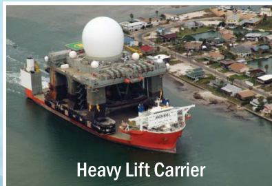
Heavy Lift Carrier