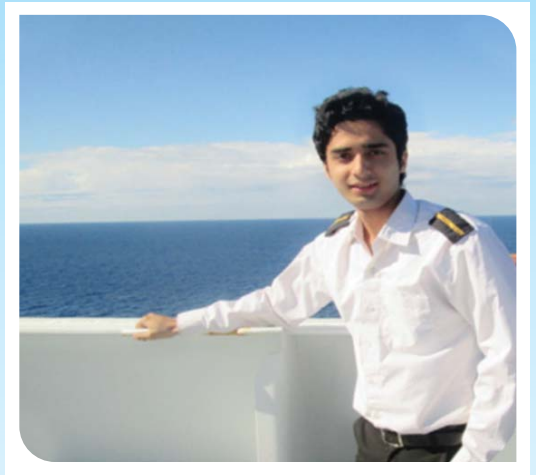
Proud ex-AEMA cadet on board

Nestled in a beautiful valley, surrounded by the Sahyadri hill ranges, along the banks of Ulhas river, few kilometres away from Karjat town in Maharashtra, lies ' Anglo-Eastern Maritime Academy ', an epitome of excellence amongst the Maritime Educational Institutions in India. Situated almost midway between Mumbai and Pune, Academy can be reached by road from Karjat which is well connected by Road as well as Rail network.