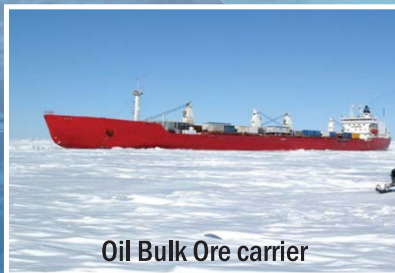
Oil Bulk Ore carrier