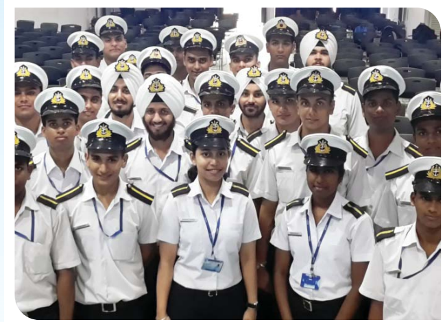
Proud AEMA cadets