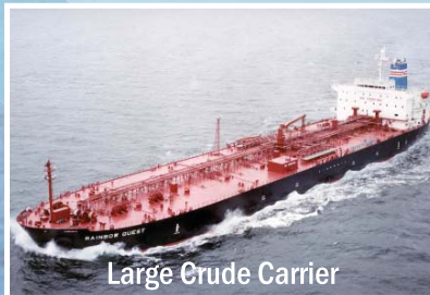
Large Crude Carrier