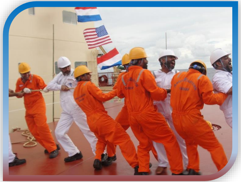
This game was full of fun. Everyone was making fun of each other and were laughing o loud .

After a small refreshment break both the team moved towards the second game. Tail the donkey.