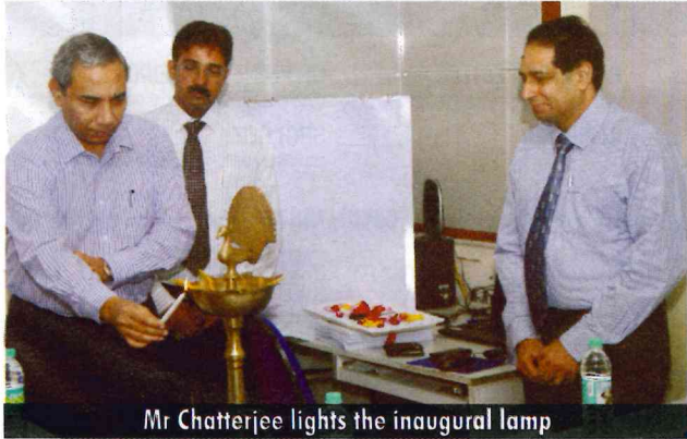
Mr Chatterjee lights the inaugural lamp