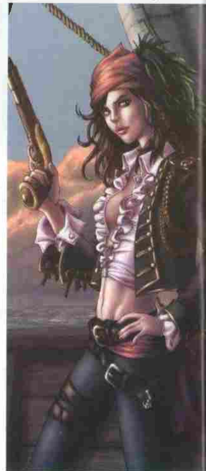
Illustration of Mary Read